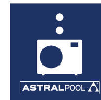
HEATPUMPGO SMART APP CONTROL

* Wifi capability included in Viron Inverter and Top Discharge Heat Pump range. Available as an optional add-on ECO models.